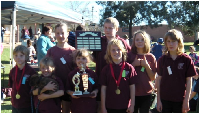
A successful Sports Carnival for Glen Alice PS