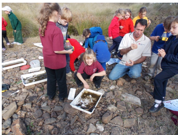
Bug Watching at Goolma PS Environment Day